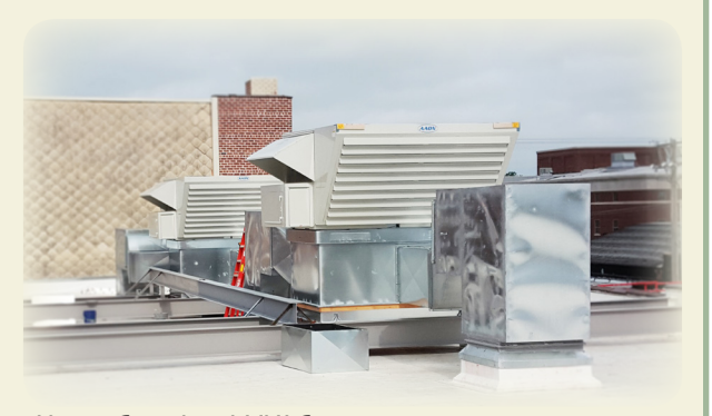
Above: Completed HVAC units