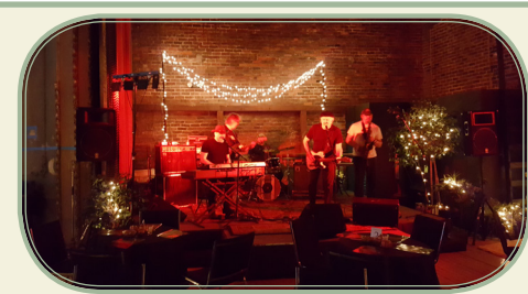
Above: The Cate Brothers Band

The 2017 Friday Flix Festival will bring family favorites Gremlins , Inside Out , and Toy Story to the outdoor screen in June, July and August. Of course, the Festival wouldn't be complete without our traditional showing of Rocky Horror Picture Show in September.