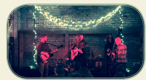
Above: The Bella Donna Band